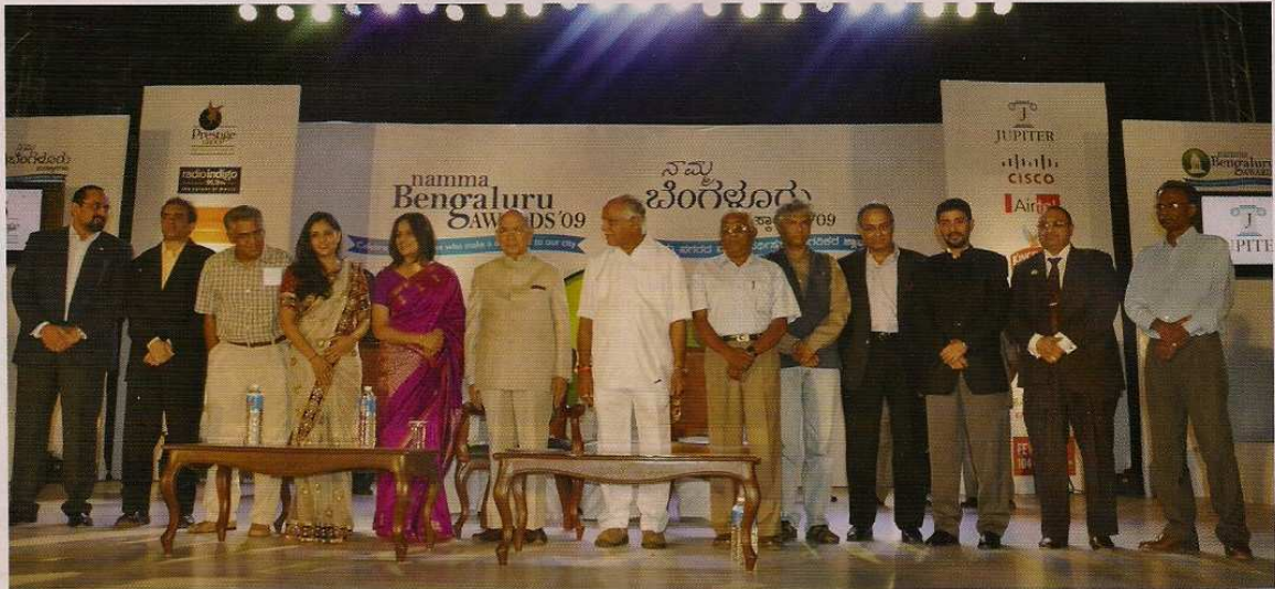
Jury members with chief guests