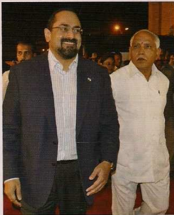
Rajeev Chandrasekhar & The Honorable Chief Minister Shri Yeddyurappa

The first-ever Namma Bengaluru Awards were presented by Governor H.R.Bharadwaj and Karnataka